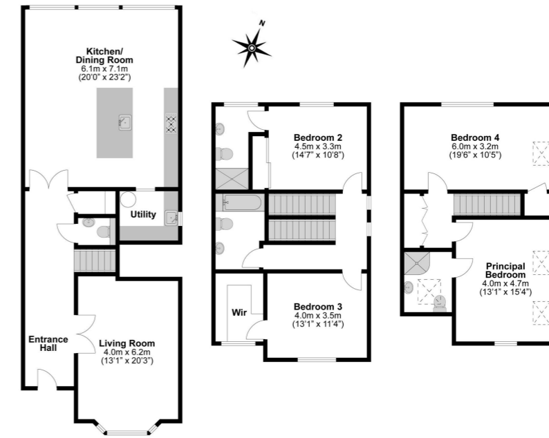
Illustrations are for identification purposes only, measurements are approximate, not to scale.

Total Approximate Floor Area 2432 Square feet 226 Square metres