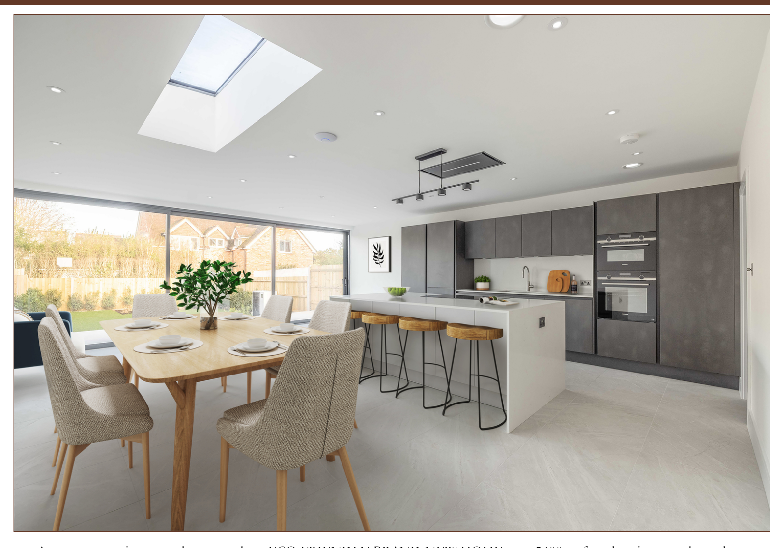
A rare opportunity to purchase a modern, ECO FRIENDLY BRAND NEW HOME over 2400 sq ft and set in a popular and sought after location within walking distance of Maidenhead Town Centre and Crossrail.

The property has been built to an exceptionally high specification throughout and features a tailor made German Leicht Kitchen with premium integrated Siemens appliances, underfloor heating, aluminium sliding doors, windows and skylights, tailor made designer wardrobes in the bedrooms, Vileroy Boch sanitary ware and furniture in the bathrooms with Grohe and JTP taps, HIB mirrors and Mandarin stone porcelain tiles. Further benefits include; mechanical ventilation for premium air quality and recovery, Air Source Heat Pump (no gas boiler), pre wired electric charger, alarm and CCTV, WIFI boosters and landscaped garden.