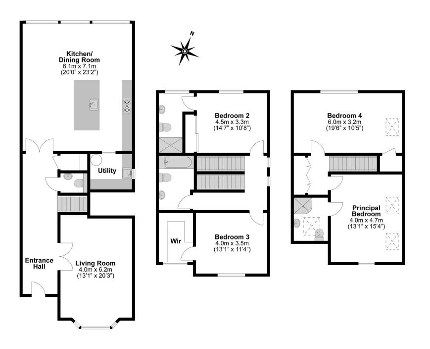
Illustrations are for identification purposes only, measurements are approximate, not to scale.

Prospective purchasers should be aware that these sales particulars are intended as a general guide only and room sizes should not be relied upon for carpets or furnishing. We have not carried out any form of survey nor have we tested any appliance or services, mechanical or electrical. All maps are supplied by Goview.co.uk from Ordnance Survey mapping. Care has been taken in the preparation of these sales particulars, which are thought to be materially correct, although their accuracy is not guaranteed and they do not form part of any contract.