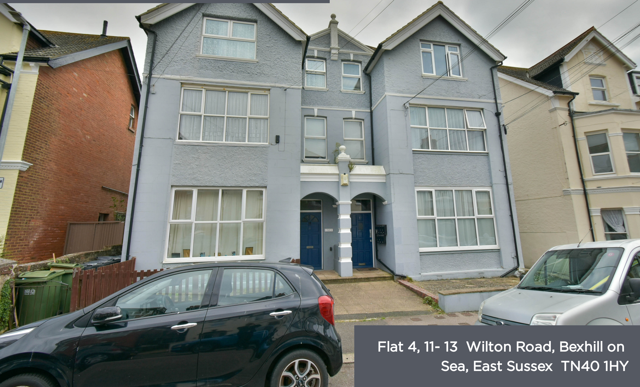
Flat 4, 11- 13 Wilton Road, Bexhill on Sea, East Sussex TN40 1HY