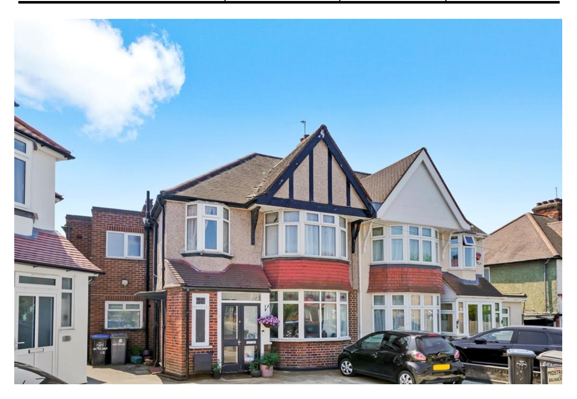
EPC Rating: C

A rare opportunity to purchase a first floor spacious two double bedroom maisonette converted from a two storey semi-detached 1930's built house and offering above average size accommodation. Benefits include:-