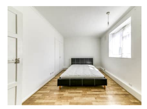
Blackthorn Court, Leigham Court Road, London, SW16