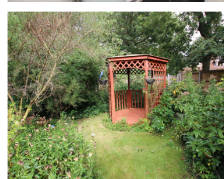
Linden 57 Church Street, Langford, Bedfordshire, SG18 9QT

An individual four bedroom detached family home in select cul-desac and situated in a mature plot with private gardens extending to approximately THIRD OF AN ACRE PLOT. Although in need of updating this property offers great potential and room to extend (if required) Ample off road parking via double length garage and a block paved drive. NO CHAIN.