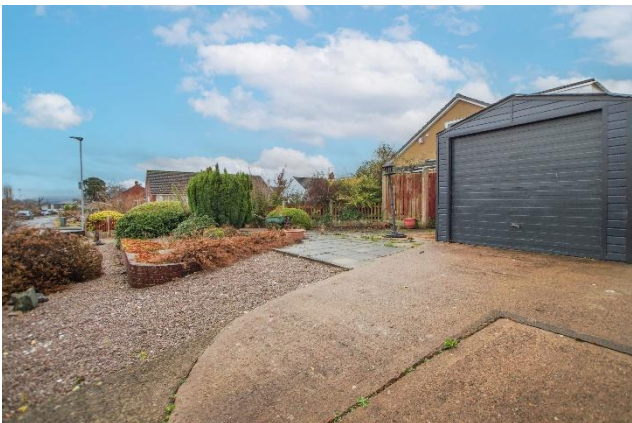
GARDENS, GARAGE & DRIVE

TENURE We are informed the tenure is Freehold.