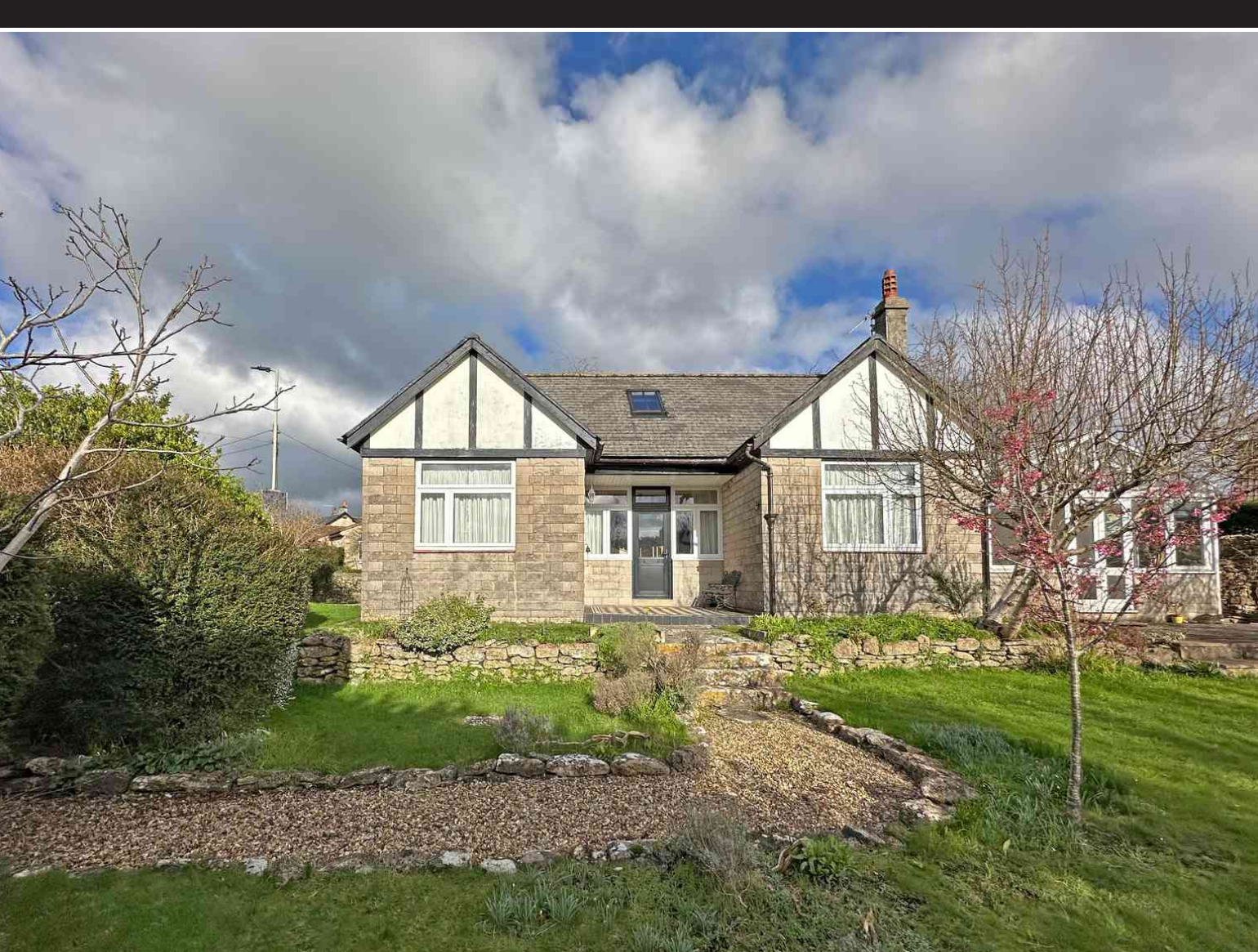
Winsley Road, Bradford on Avon