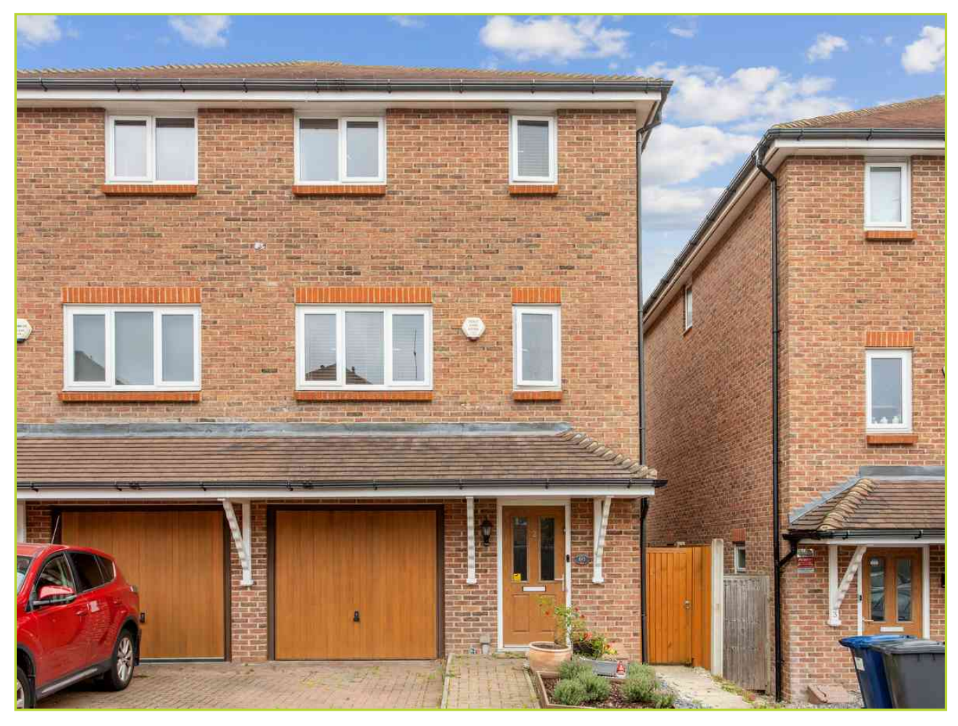
Earlsbury Gardens, Edgware. HA8 8BF. Freehold

Bright & Spacious 4 Bedroom 3 Bathroom Semi-Detached Town House, boasting well-proportioned accommodation set on 3 floors including 2 en-suite shower rooms. The property is located on this private road of Glendale Avenue being a short distance to both Stanmore & Edgware's underground stations. Other features include garage with driveway, fitted kitchen with separate dining area, guests cloakroom and rear garden.