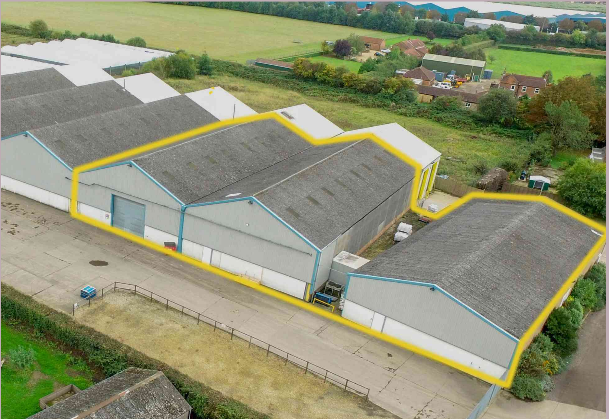
Unit C,D & E, East Coast Storage, Wisbech £70,000 Per Annum