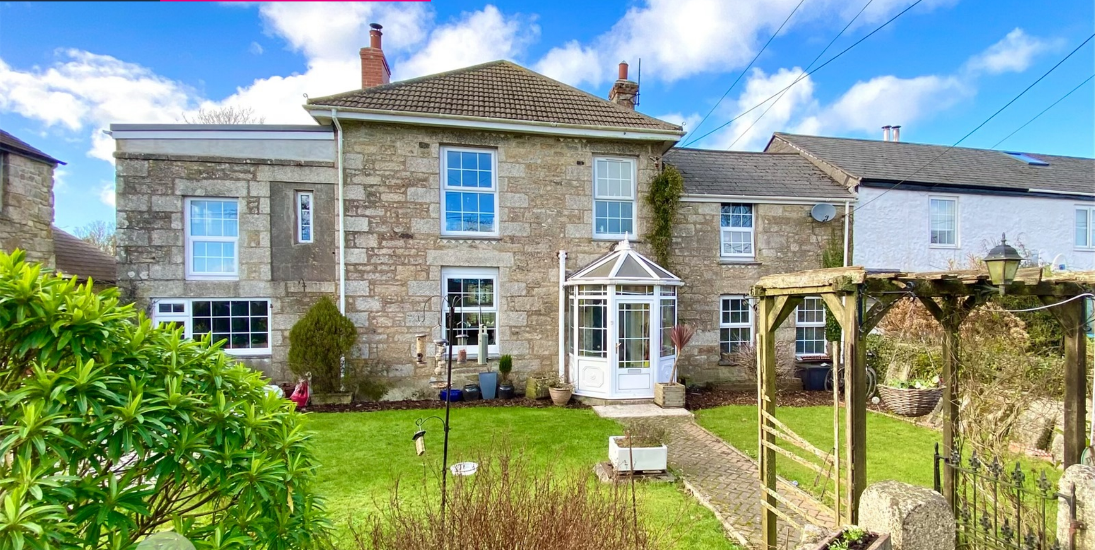
Penmount House, Menherion, Stithians, Cornwall TR16 6NW