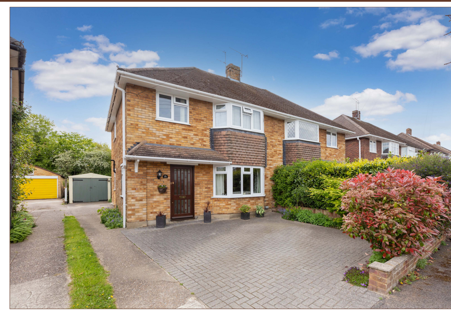
An immaculately presented THREE bedroom semi detached family home located in the ever-popular Altwood area of Maidenhead which comes to the market in turn key condition. Featuring a welcoming hallway, contemporary kitchen with built in appliances and access to the garden, a wonderfully light and bright open plan reception room with ample space for dining and relaxing

To the first floor is the spacious main bedroom with bay fronted window, built in storage and separate toilet and wash basin, a further double bedroom enjoying views out on the garden, a good sized single bedroom and a well appointed family bathroom