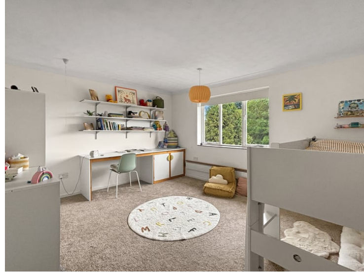
14' 8" x 12' 0" (4.47m x 3.66m) Window to front and radiator.