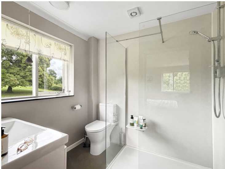
7' 6" x 6' 6" (2.29m x 1.98m) Window to side, walk in shower, close coupled WC, vanity wash hand basin with recessed storage mirror.