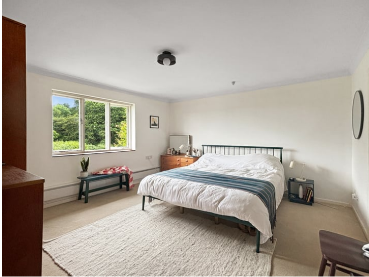
14' 8" x 14' 2" (4.47m x 4.32m) Window to rear, radiator and door to.