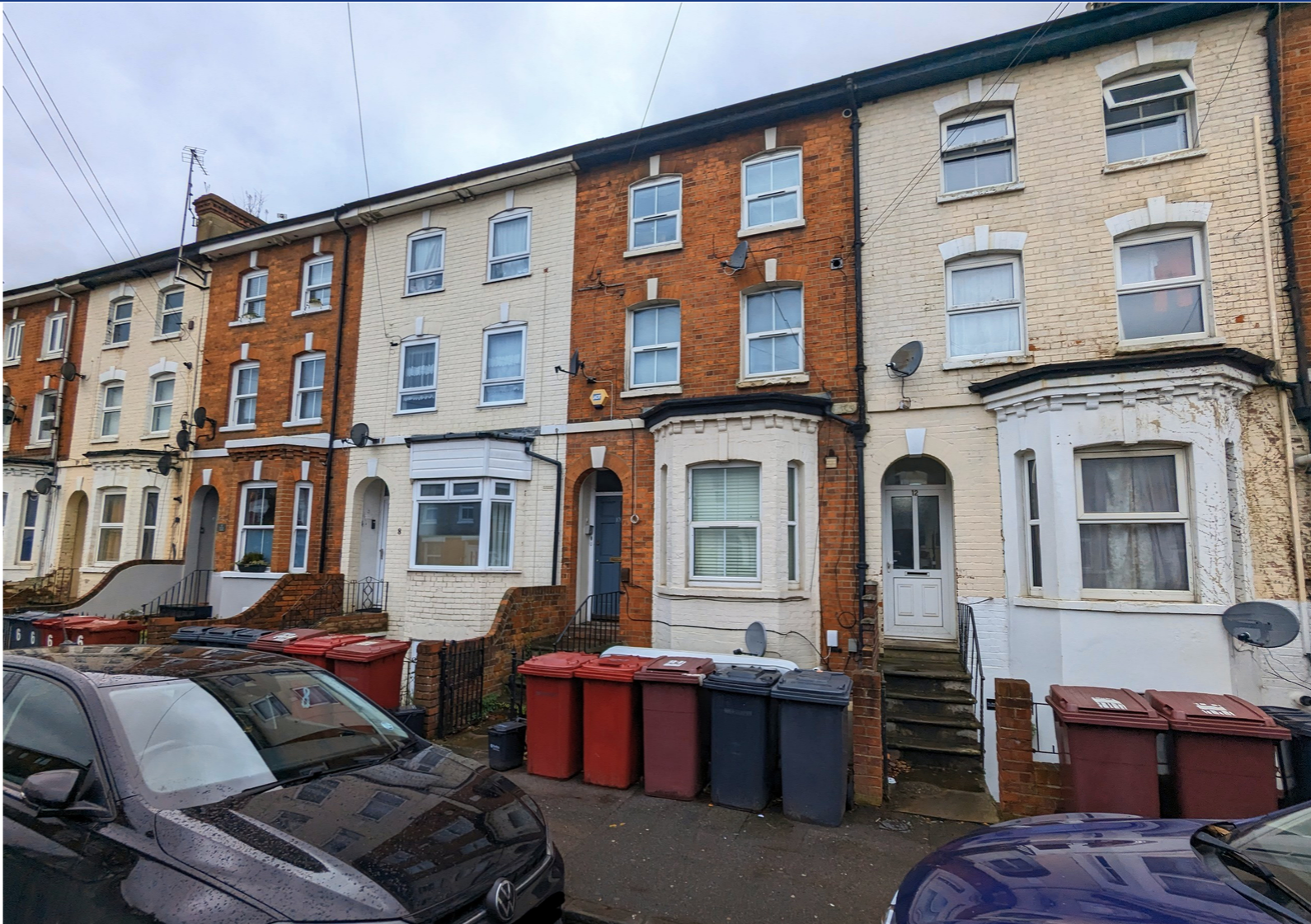
George Street, Reading, Berkshire. RG1.