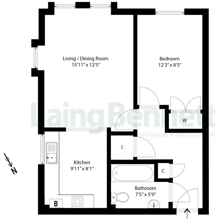
Illustration for identification purposes only. Measurements are approximate. Dimensions given are between the widest points. Not to scale. Outbuildings are not shown in actual location.

Approximate Gross Internal Area = 48 sq m / 520 sq ft