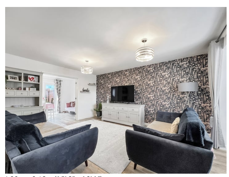
4.80m x 3.69m (15' 9" x 12' 1")