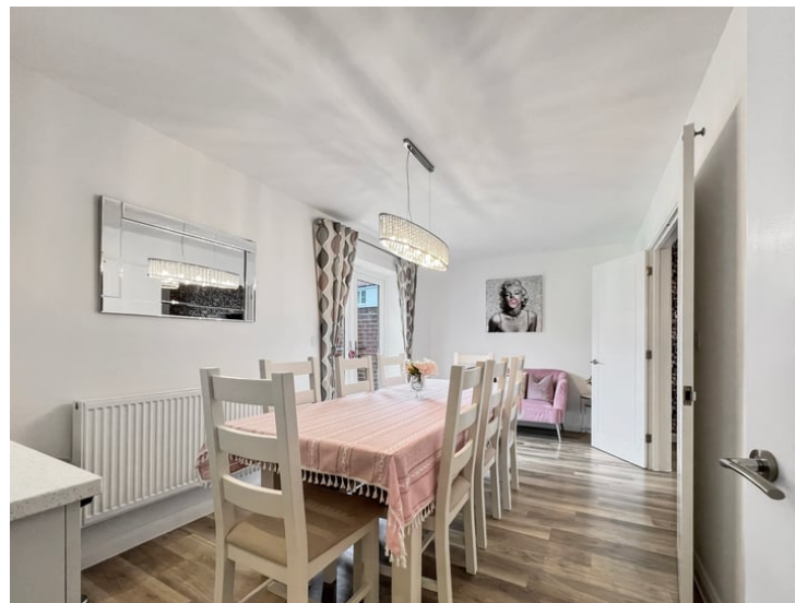
8.26m x 3.32m (27' 1" x 10' 11")