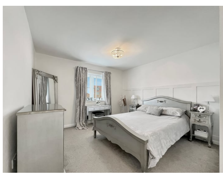
5.89m x 3.48m (19' 4" x 11' 5")