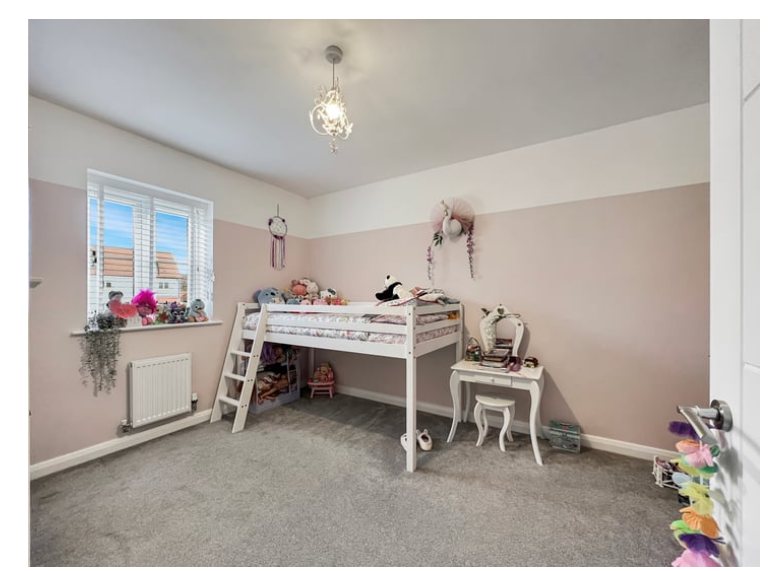
3.92m x 3.02m (12' 10" x 9' 11")