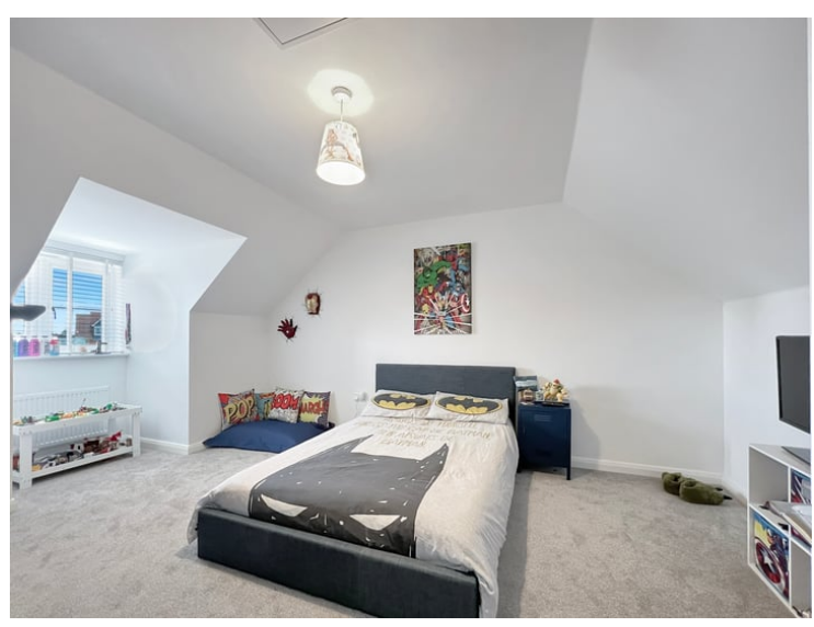
5.61m x 3.47m (18' 5" x 11' 5")