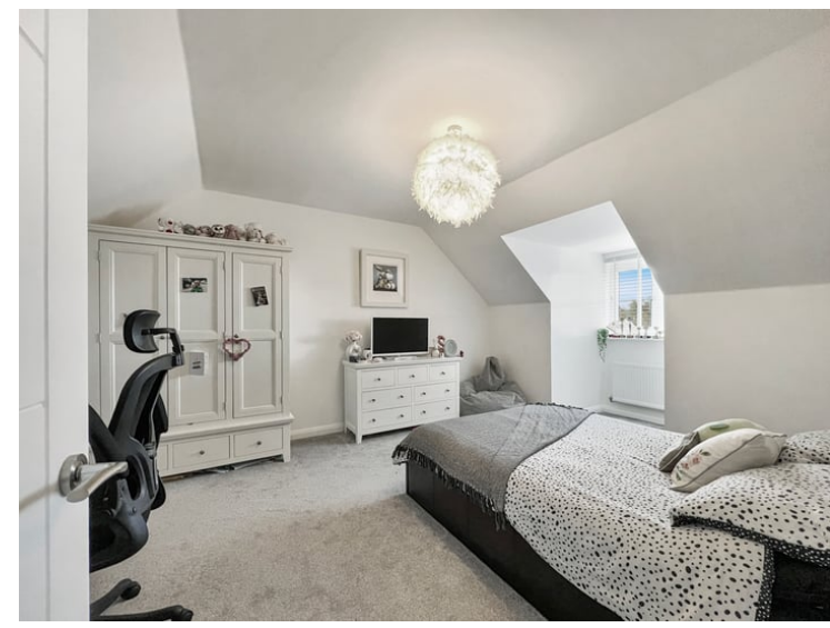
5.61m x 3.64m (18' 5" x 11' 11")