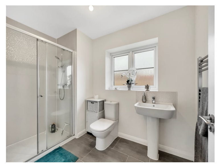
2.86m x 1.72m (9' 5" x 5' 8")