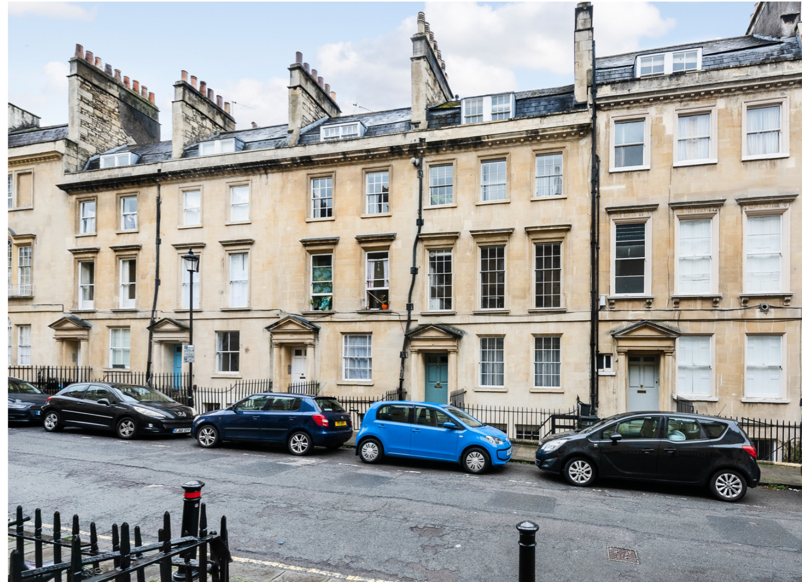
Rivers Street, Bath