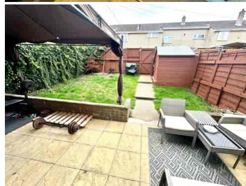
Thongsley, Huntingdon PE29 1NX