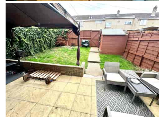
Thongsley, Huntingdon PE29 1NX