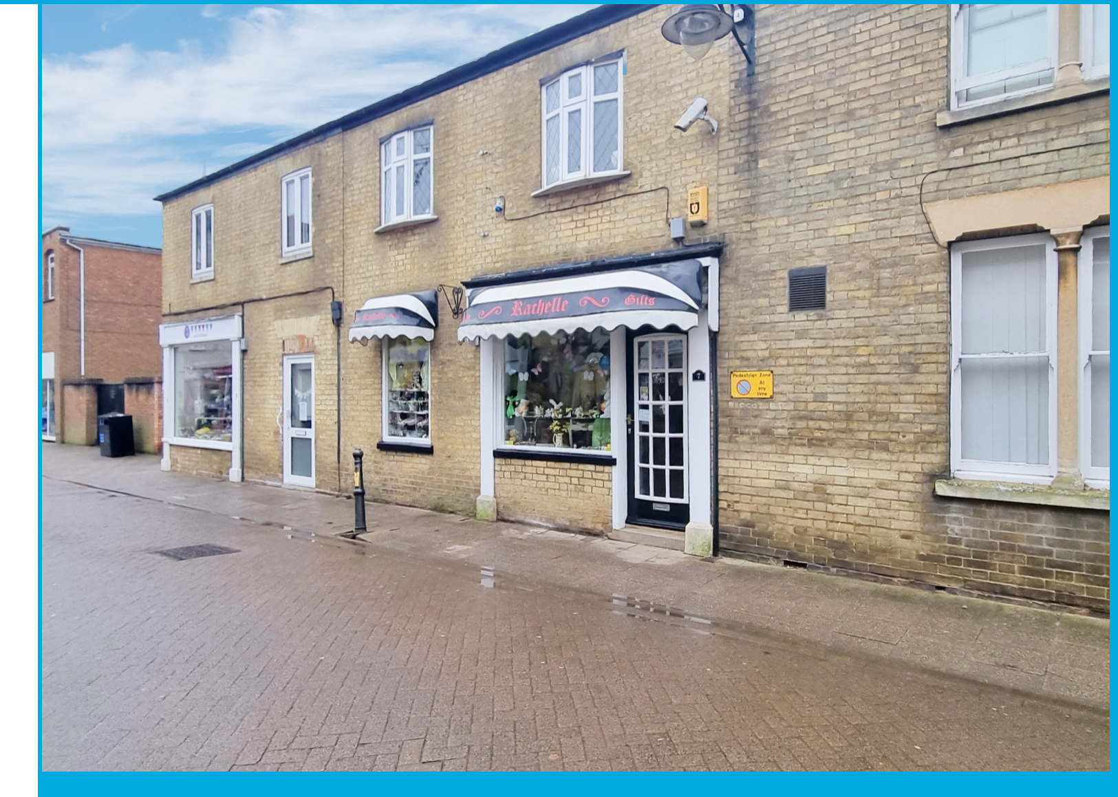
7 HIGH CAUSEWAY, WHITTLESEY, PETERBOROUGH, CAMBRIDGESHIRE. PE7 1AE