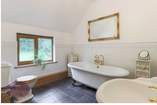
Substantial Detached Character Cottage