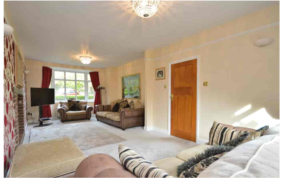
48 Thorpeville, Moulton, Northampton NN3 7TR £750,000 - Freehold