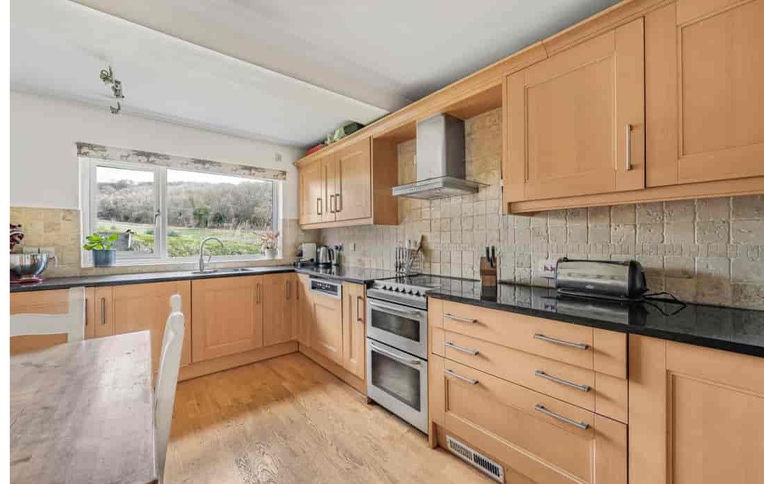
10 Ragmans Close, Marlow, Buckinghamshire SL7 3QW Guide Price £795,000 - Freehold