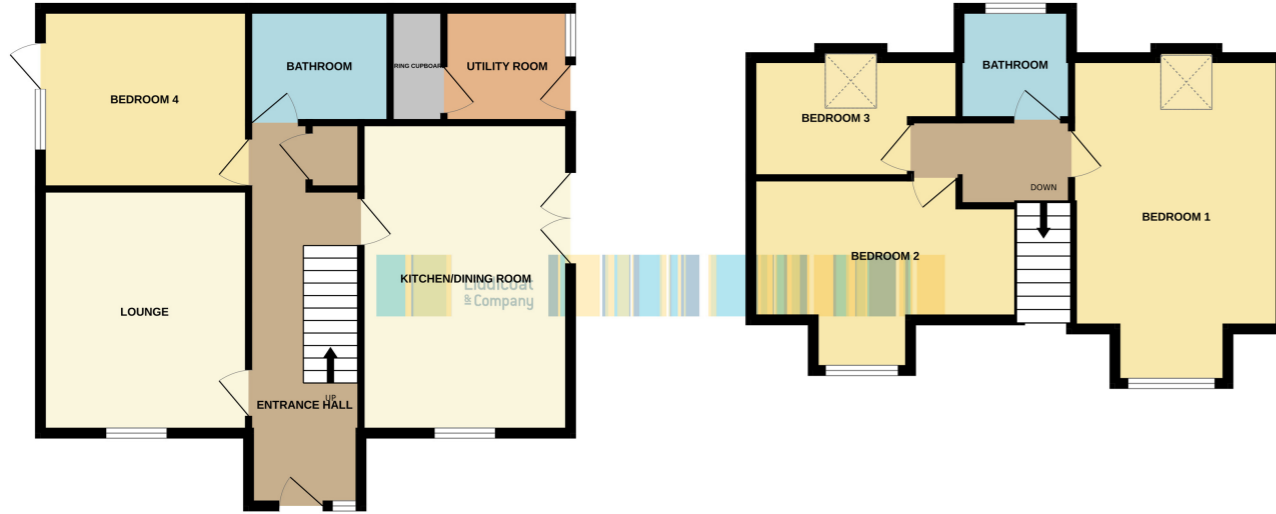
1ST FLOOR 454 sq.ft. (42.1 sq.m.) approx.

TOTAL FLOOR AREA : 1146 sq.ft. (106.5 sq.m.) approx. Whilst every attempt has been made to ensure the accuracy of the floorplan contained here, measurements of doors, windows, rooms and any other items are approximate and no responsibility is taken for any error, omission or mis-statement. This plan is for illustrative purposes only and should be used as such by any prospective purchaser. The services, systems and appliances shown have not been tested and no guarantee as to their operability or efficiency can be given. Made with Metropix ©2023