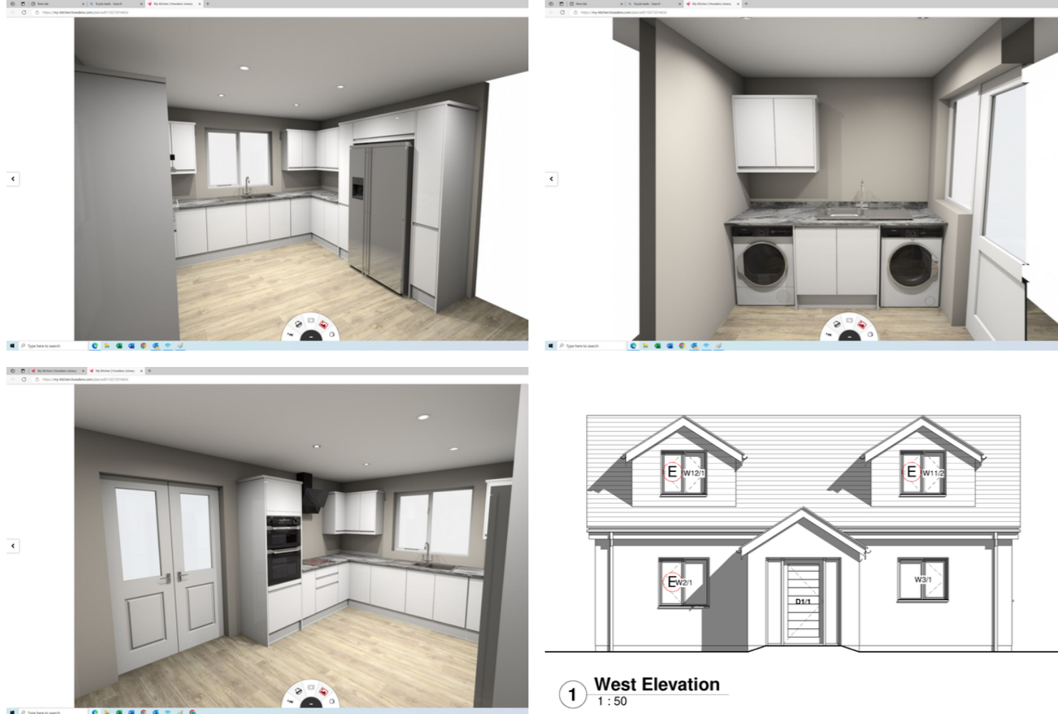
1 West Elevation 1 : 50