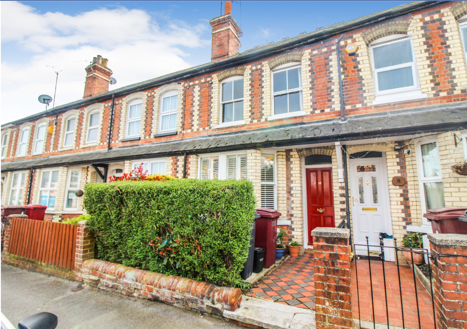
St Georges Terrace, Reading, Berkshire.