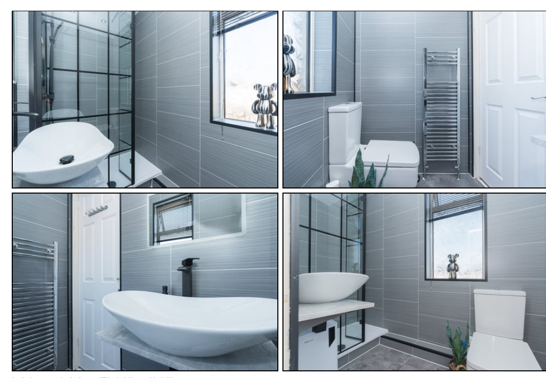
2.39m x 1.26m (7' 10" x 4' 2")