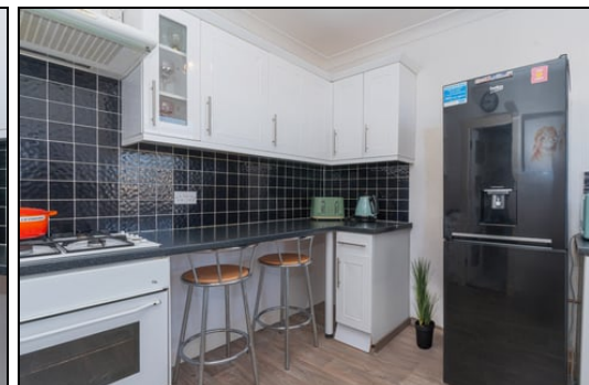
2.86m x 2.74m (9' 5" x 9' 0")