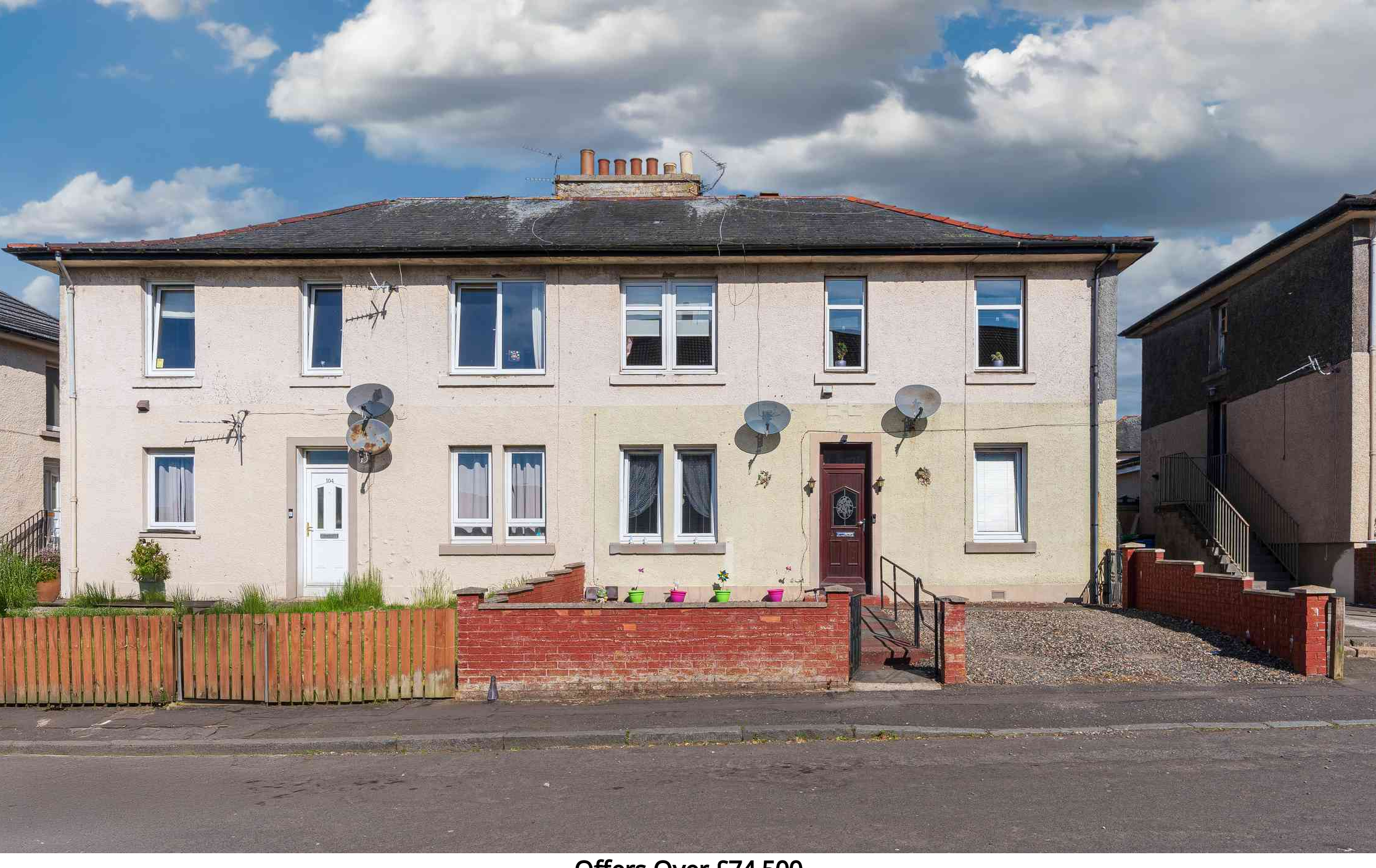
Offers Over £74,500 100 North Street, Lochgelly, Fife, KY5 9NR