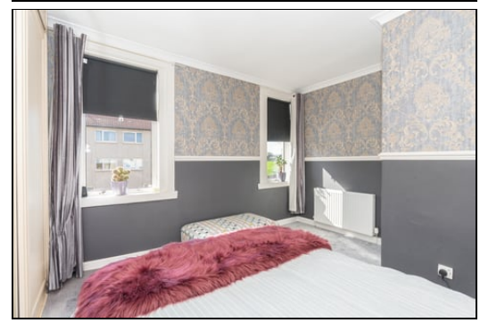
3.7m x 3.48m (12' 2" x 11' 5")