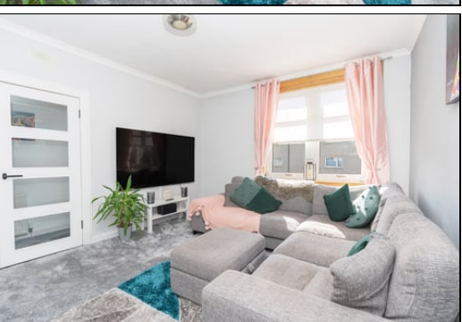
4.17m x 3.65m (13' 8" x 12' 0")