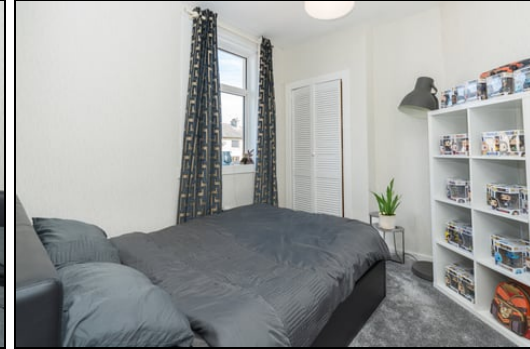
2.92m x 2.87m (9' 7" x 9' 5")