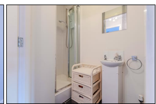
1.2m x 2.5m (3' 11" x 8' 2")