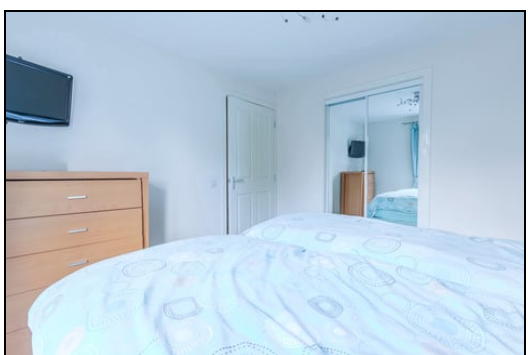
3.2m x 3.3m (10' 6" x 10' 10")