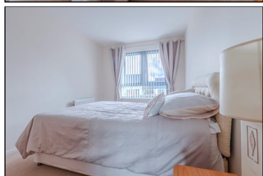
3.3m x 3.9m (10' 10" x 12' 10")