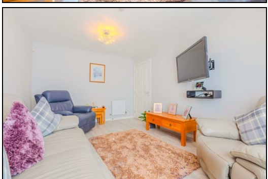
3.4m x 4.6m (11' 2" x 15' 1")