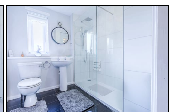
2.5m x 2.2m (8' 2" x 7' 3")