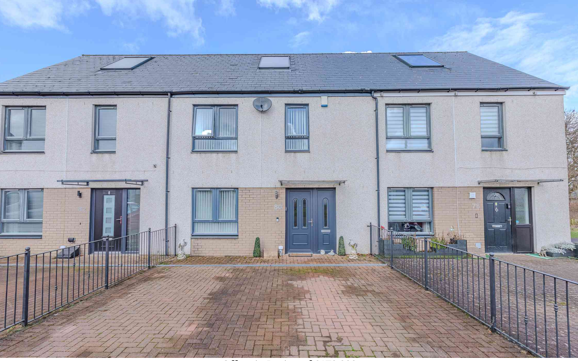
Offers in Region of £170,000 80 Netherton Road, Cowdenbeath, Fife, KY4 9BU