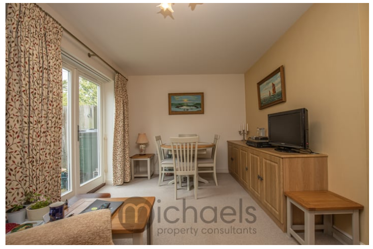
16' 8" x 16' 4" (5.08m x 4.98m)