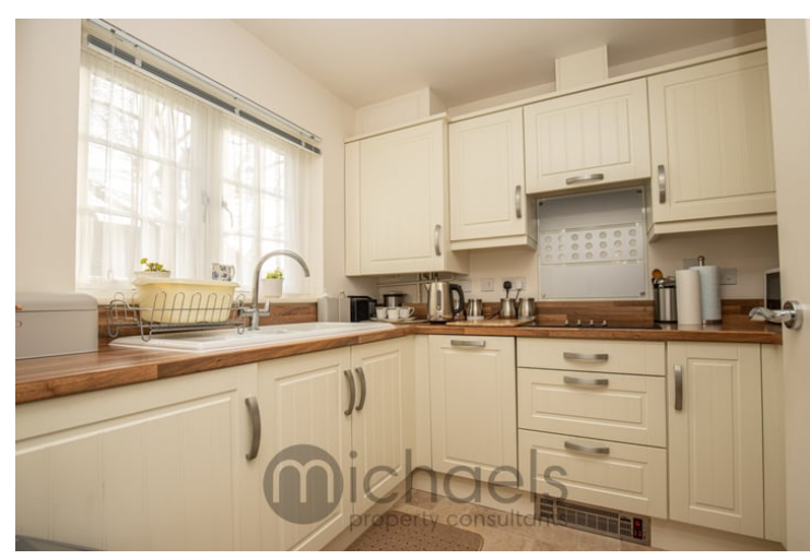
8' 10" x 7' 6" (2.69m x 2.29m)