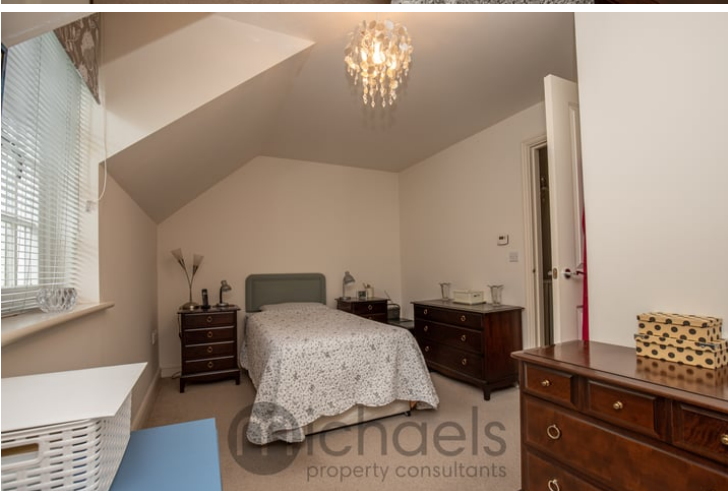
16' 8" x 9' 5" (5.08m x 2.87m)