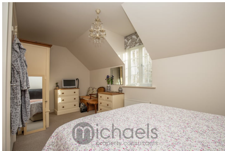
16' 8" x 8' 10" (5.08m x 2.69m)