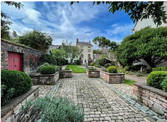
EXTERNAL FROM TULLIE HOUSE