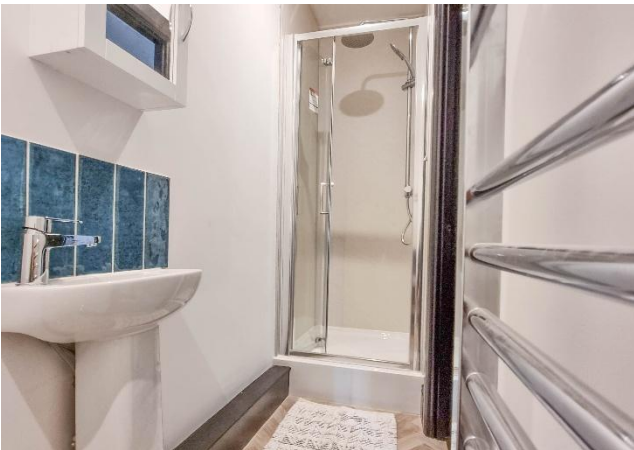
SHOWER ROOM 3