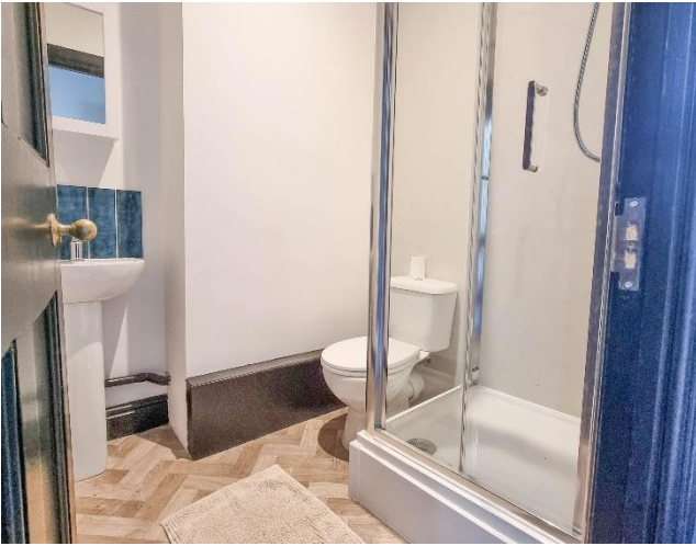
SHOWER ROOM 2