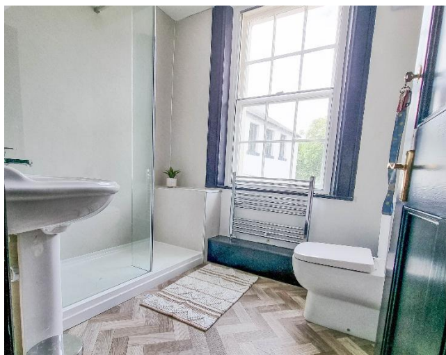
SHOWER ROOM 1