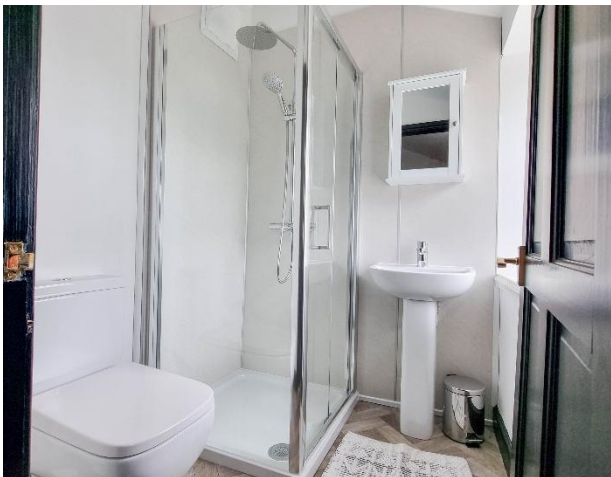
BEDROOM 6 EN-SUITE