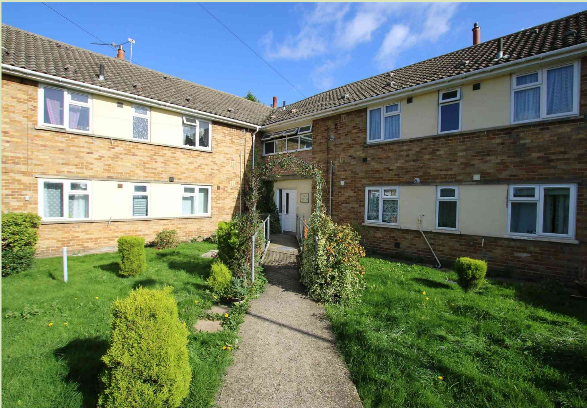
8 Anderson Close, King's Lynn Guide Price £110,000