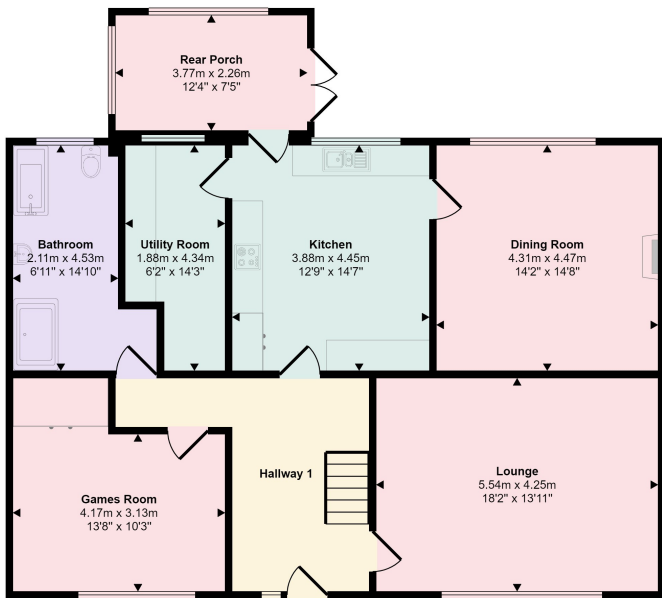
Ground Floor Approx 122 sq m / 1311 sq ft

Approx Gross Internal Area 182 sq m / 1955 sq ft