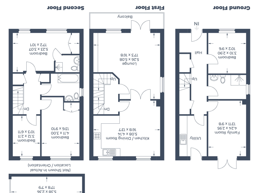
Illustration for identification purposes only, measurements are approximate, not to scale. © CJ Property Marketing Produced for Peter & Lane

If ps 269,\Gamma \setminus m ps 2.72\Gamma = 1610T