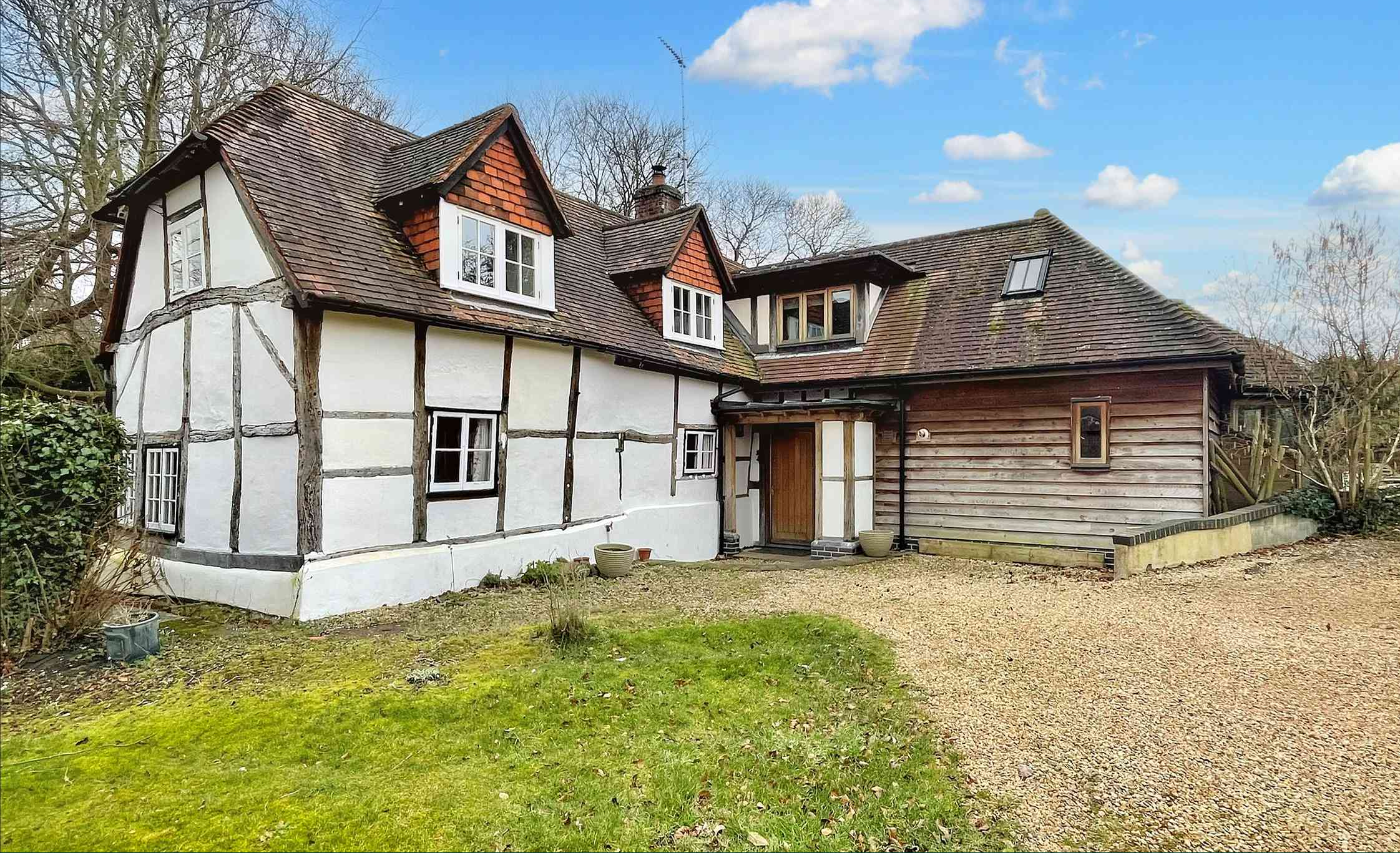
Cobblers Cottage, East Hendred OX12 8JT Oxfordshire, £775,000