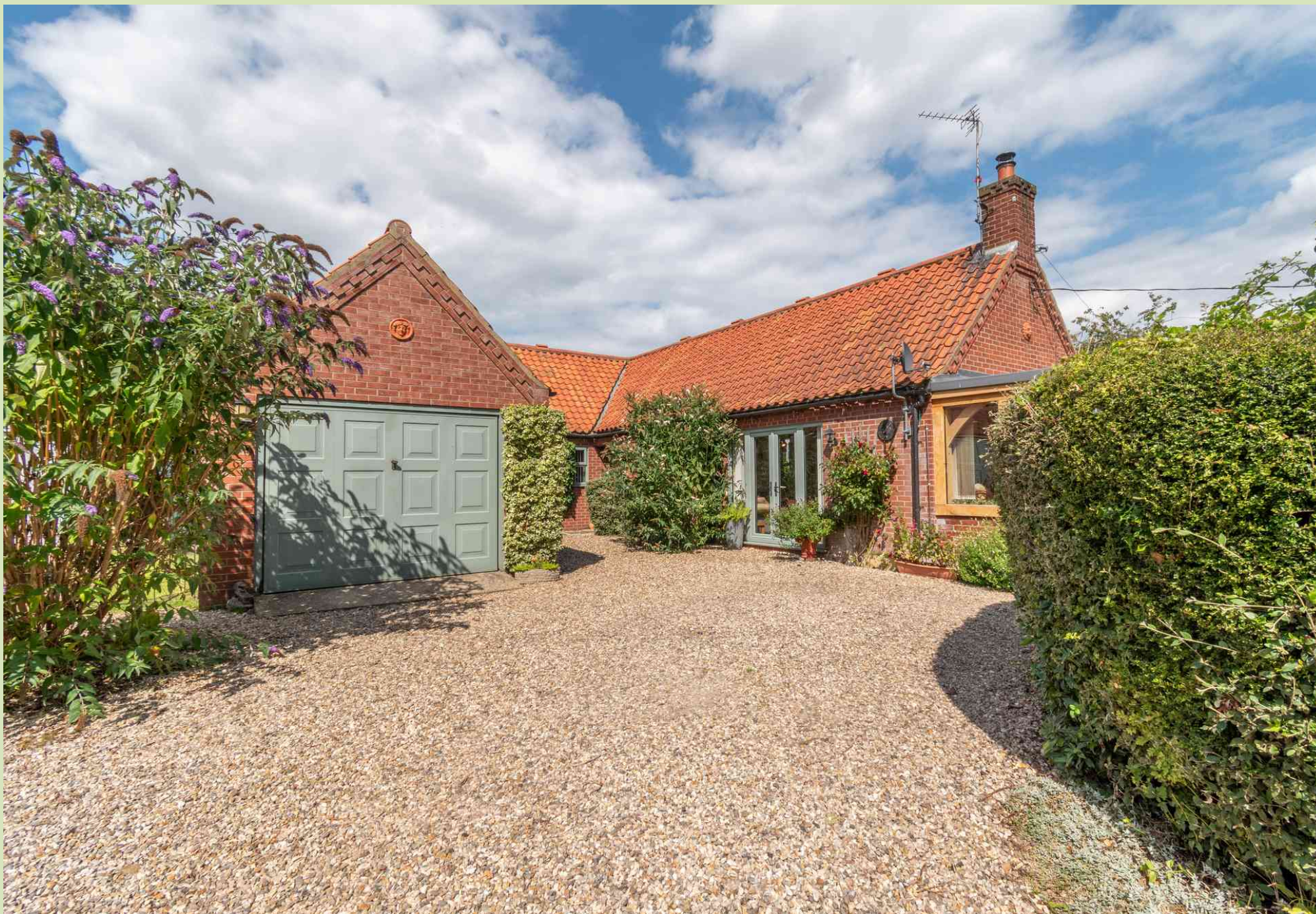
Mole Lodge, Stiffkey Offers in Excess of £600,000