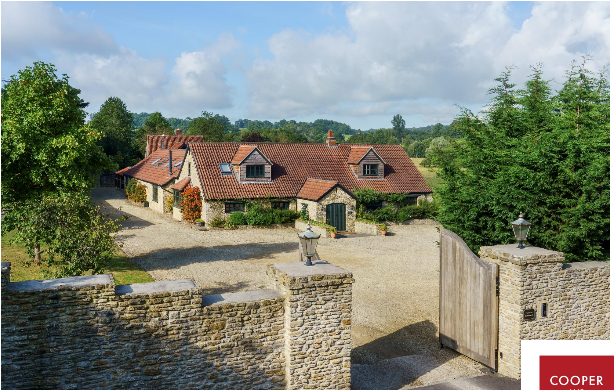
Horseshoe Lodge, Stubbs Lane, Beckington, Somerset BA11 6TE