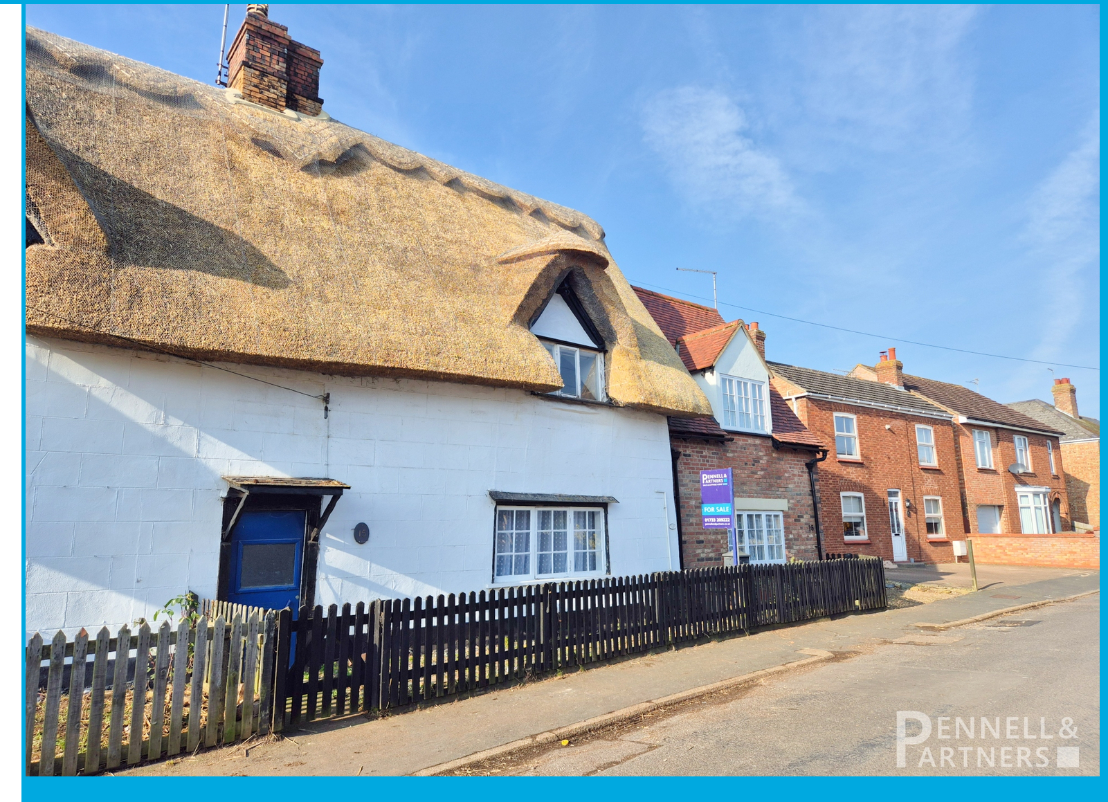
15 LOW CROSS, WHITTLESEY, PETERBOROUGH. PE7 1HW