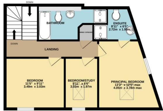
1ST FLOOR 551 sq.ft. (51.1 sq.m.) approx.