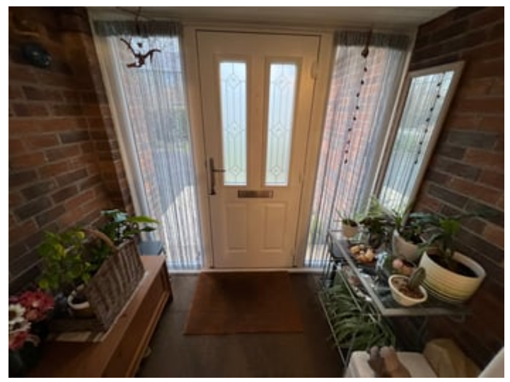
7' 2" x 4' 8" (2.18m x 1.42m) via composite half glazed door with glazed side panels, glazed door into -