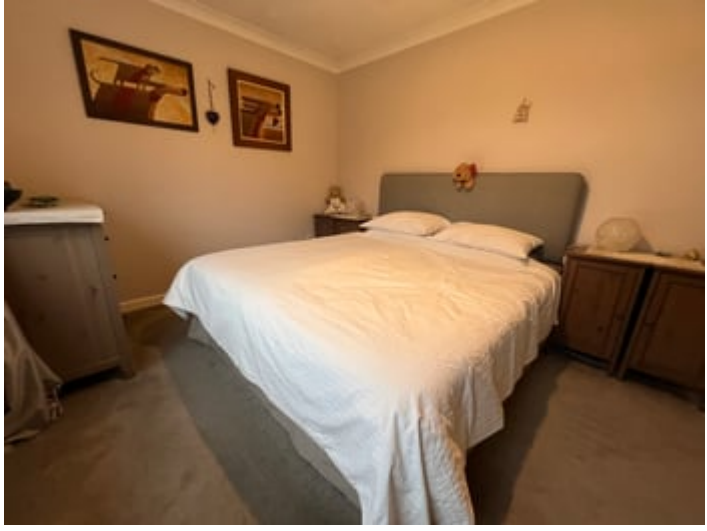
14' 0" x 14' 3" (4.27m x 4.34m) (L Shaped) with double glazed window to front, central heating radiator, multiple sockets.