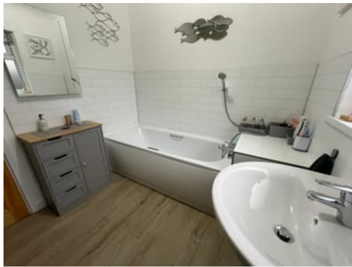
7' 2" x 7' 11" (2.18m x 2.41m) having a recently installed White suite comprising of a panelled bath with mixer tap and shower head above, pedestal wash hand basin, dual flush w.c. central heating radiator, illuminous mirror, tile effect shower boards, wood effect vinyl flooring, frosted window to side.