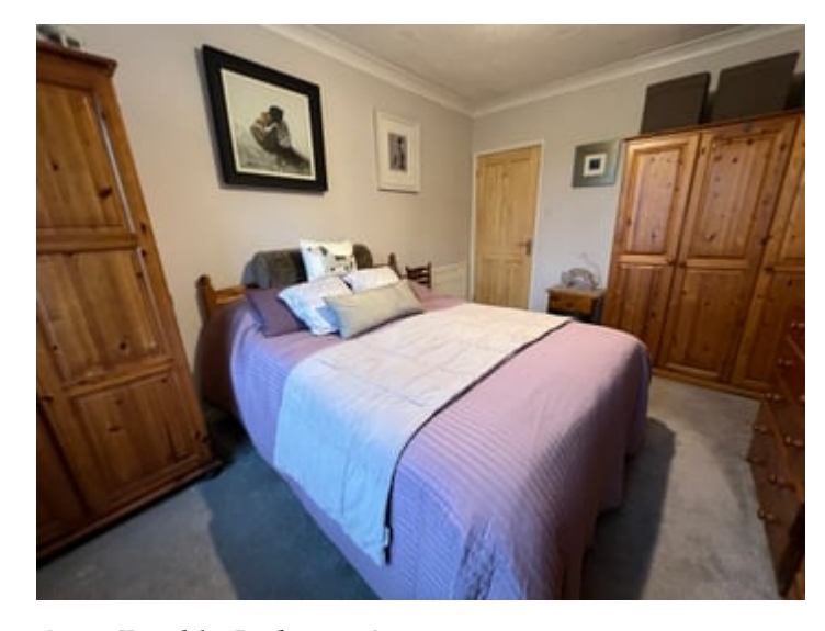
Front Double Bedroom 2