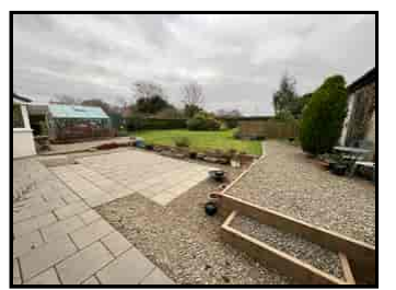
Tawelfan Caerwedros, New Quay, Ceredigion. SA44 6BS.