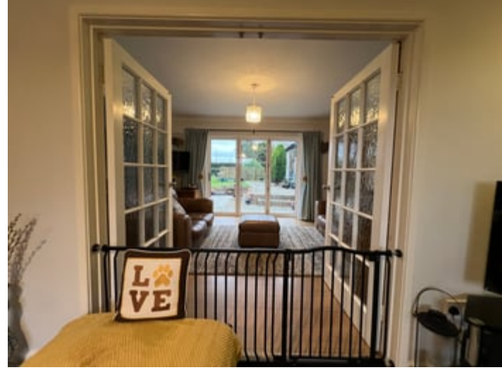
17' 10" x 11' 11" (5.44m x 3.63m) a good sized family lounge area with double glazed window to front, inset woodburning stove, on a slate hearth, central heating radiator, alcove to both sides, glass double doors into -