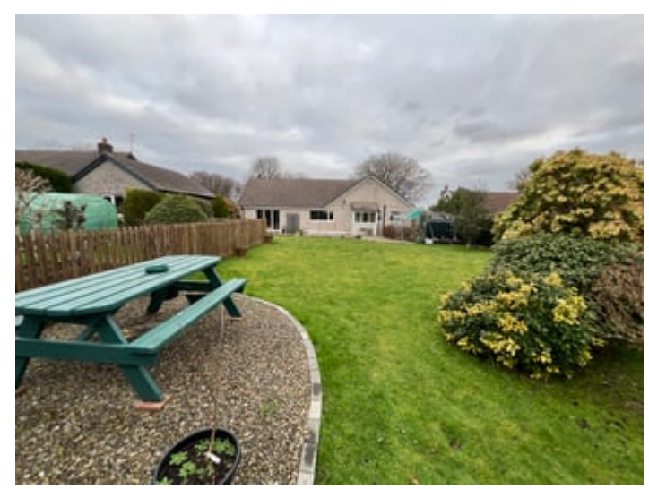
8' x 10' Greenhouse.

Large vegetable garden with raised beds.