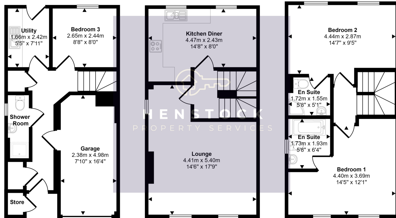
Ground Floor Approx 37 sq m / 401 sq ft

Approx Gross Internal Area 113 sq m / 1216 sq ft