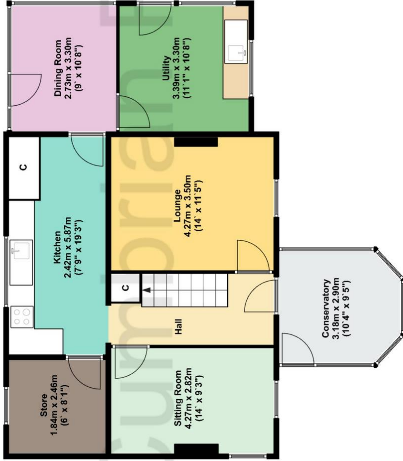
Ground Floor Approx 81.00 Sq meters (872.00 Sq feet).