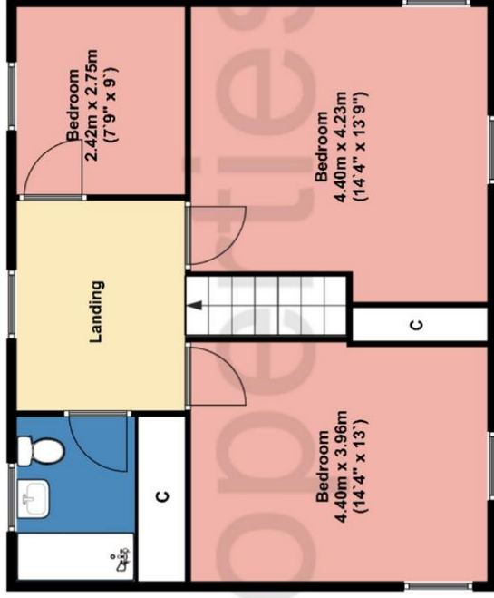
First Floor Approx 51.00 Sq meters (549.00 Sq feet).