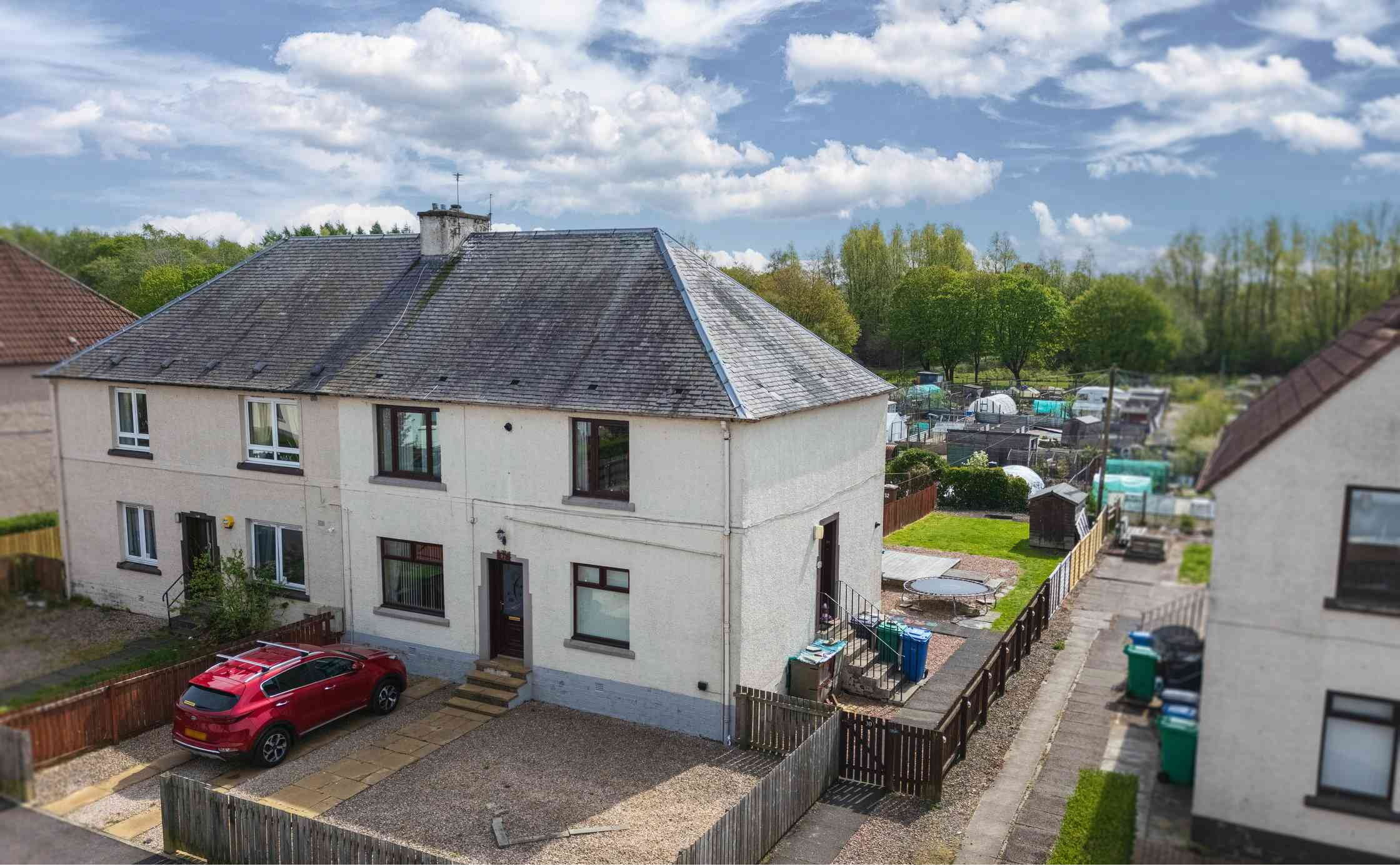
Offers Over £74,950 30 Factory Road, Cowdenbeath, Fife, KY4 9SQ