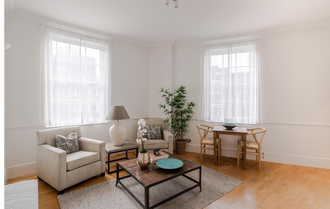
Sales - Flat 6, 147 George Street, Marylebone, London, W1H 5LB £850,000 - Leasehold