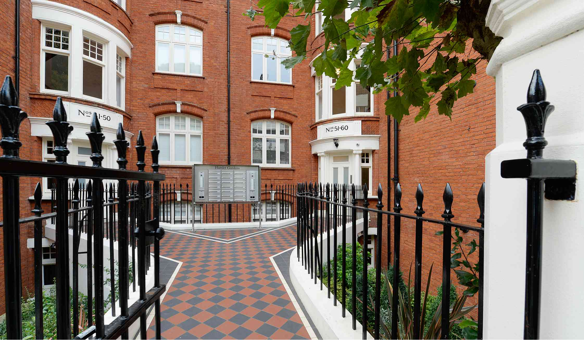
King Street, London, W6 0SP