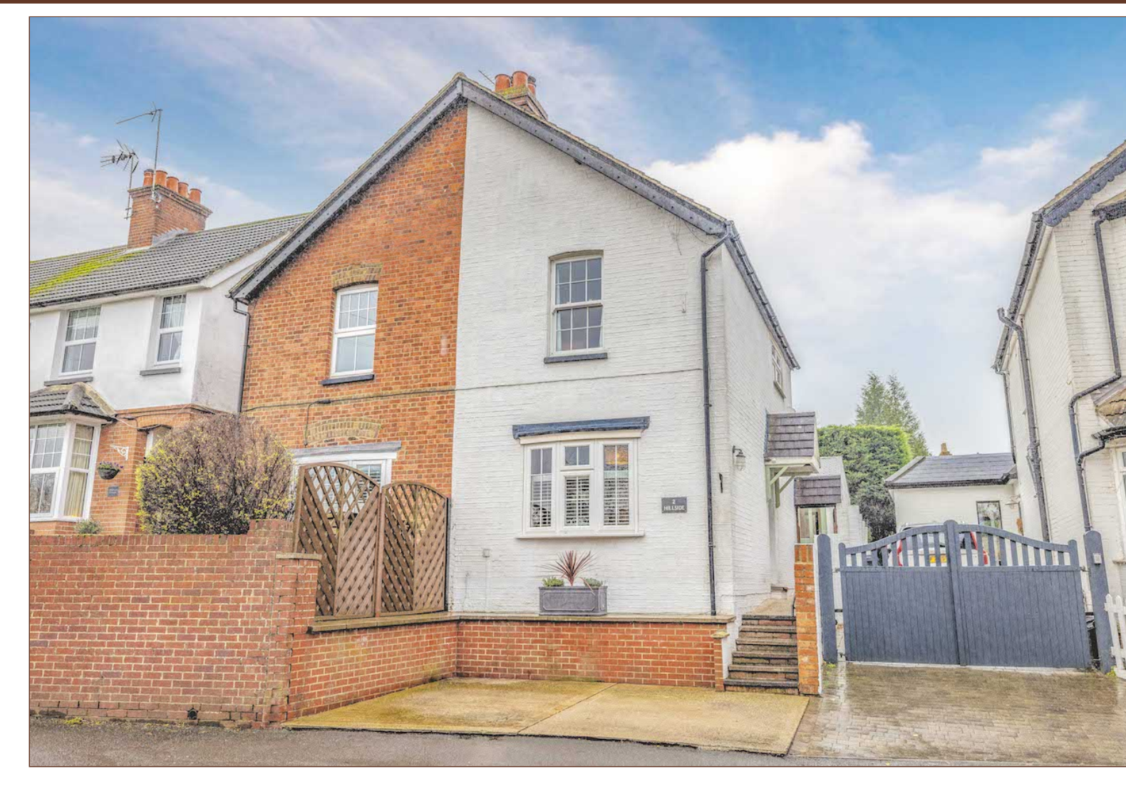
A charming and tastefully extended 2 double bedroom semi-detached period home stylishly finished to an impeccable standard throughout within a short walk of the village and station.

The spacious accommodation includes a 25ft living/dining room with an attractive feature fireplace, log burner and fitted units to either side. There is a well-equipped modern kitchen which opens to the bright and airy family room which provides access to the rear terrace and garden via the bi-folding doors. There is also a utility room with access to the front of the property as well as a recently refurbished downstairs shower room. On the first floor there are two spacious double bedrooms as well as a luxurious en-suite bathroom with freestanding bath, walk-in shower and his-and-hers basins to the main bedroom.