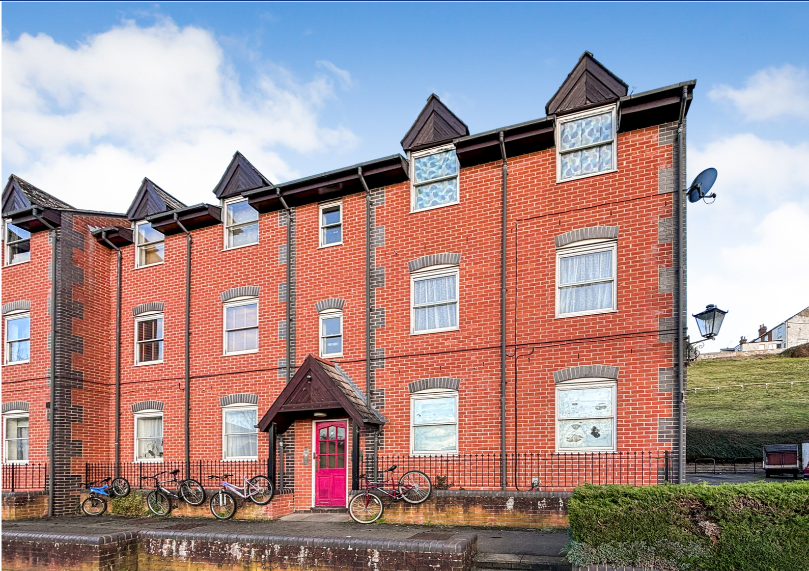
Lynden Mews Dale Road, READING, Berkshire. RG2.