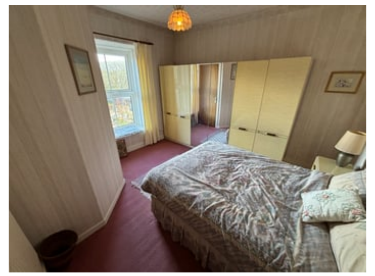
12' 7" x 11' 7" (3.84m x 3.53m). With radiator.