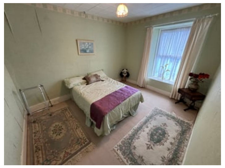
12' 9" x 10' 6" (3.89m x 3.20m). With radiator.