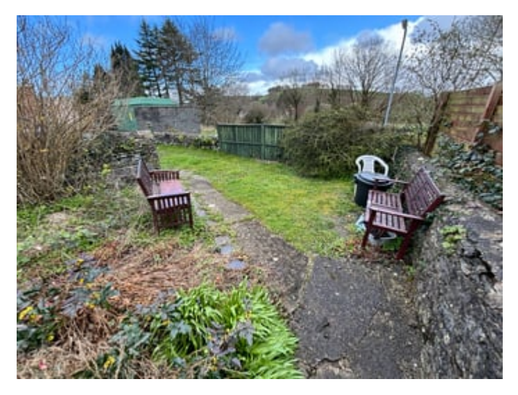
VIEWS TO REAR