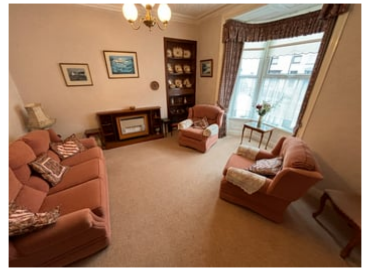
13' 7" x 12' 6" (4.14m x 3.81m) into bay. With radiator, alcove fitted shelving, gas fire with timber surround.

Accessed via a solid front entrance door with fan light over, staircase to the first floor accommodation with understairs storage cupboard, radiator.