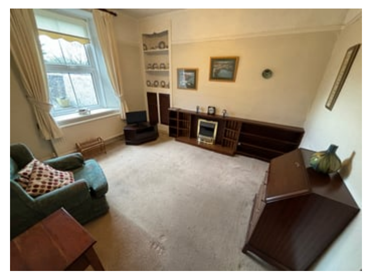
13' 0" x 11' 6" (3.96m x 3.51m). With radiator, electric fire with surround, alcove built-in cabinets.