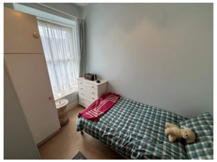
9' 6" x 7' 0" (2.90m x 2.13m). With radiator.