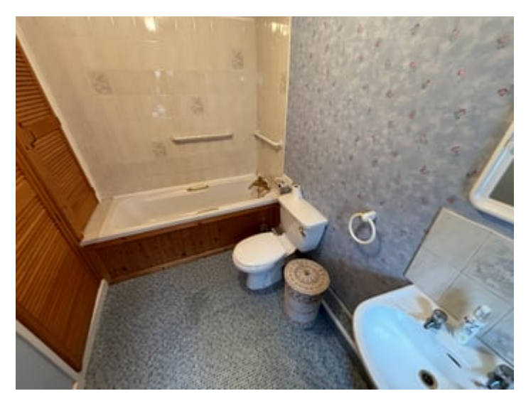
Having a 3 piece suite comprising of panelled bath with shower over, low level flush w.c., pedestal wash hand basin, radiator, boiler cupboard housing the Valliant combi boiler.