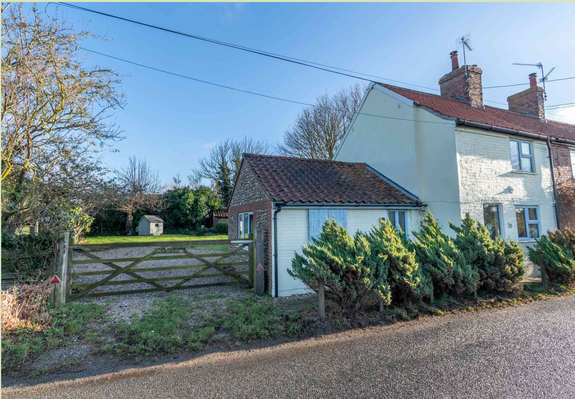
Woods End Cottage, Binham Offers in Excess of £300,000