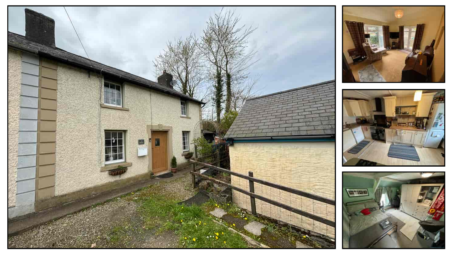
A deceptive and traditional 3 bedroomed cottage with a terraced garden and spectacular views over the Teifi Valley. Llanwnnen, near Lampeter, West Wales

Estate Agents | Property Advisers Local knowledge, National coverage