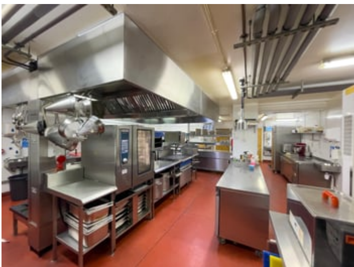
Y Talbot boasts a 'state of the art' purpose built commercial kitchen.