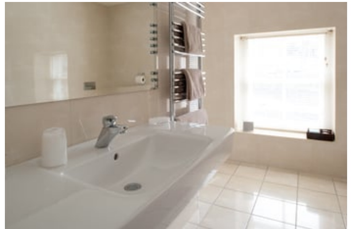
En-suite Bedroom with bathroom