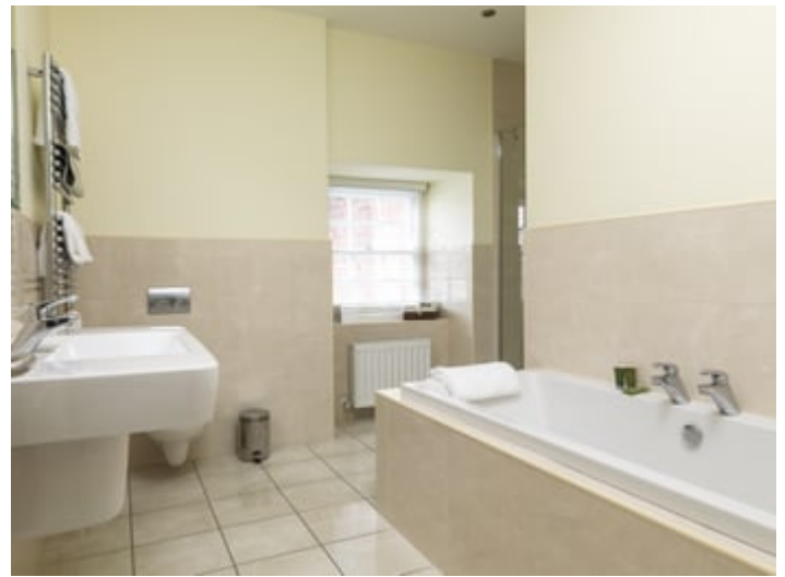
En-suite Bedroom with bathroom