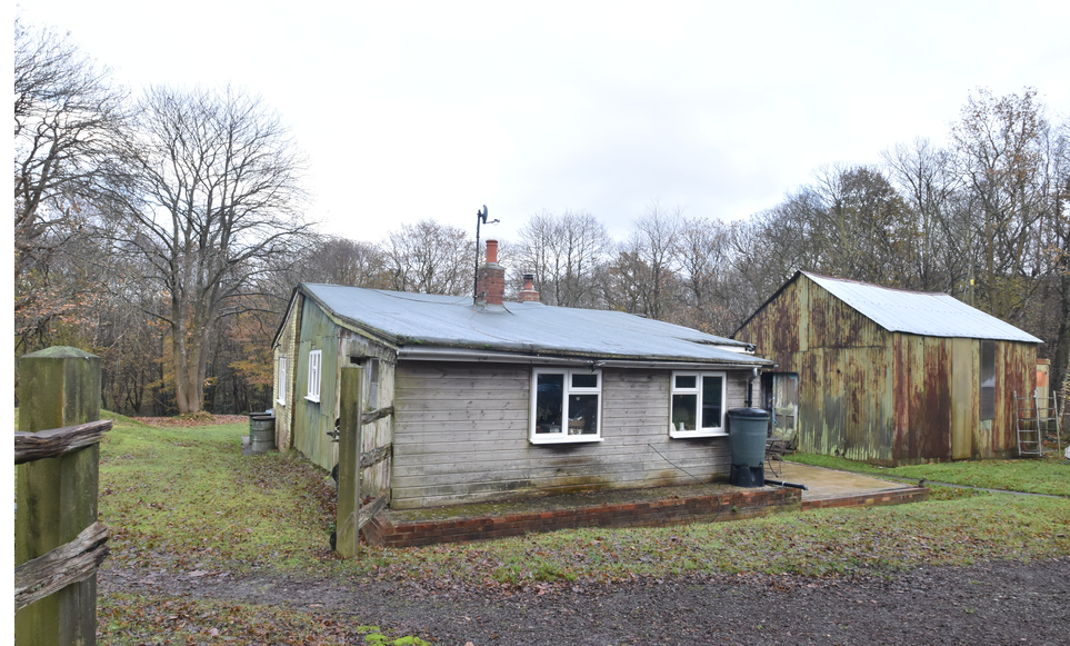
The Shack, Ravensdane Wood, Charing, Ashford, Kent TN27 0NJ £550,000 - Not Applicable