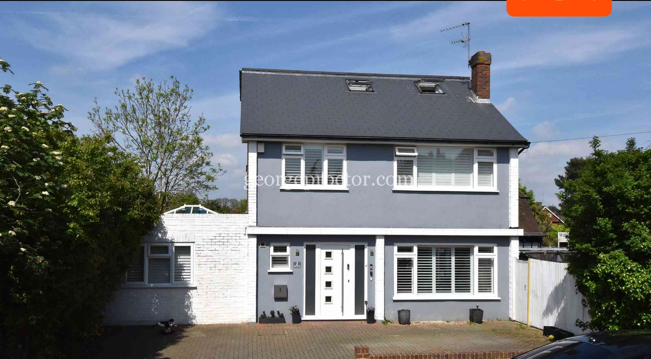
Mayfield Road, Bickley, Kent. BR1 2HD